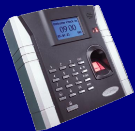
Модел: PT-AT-FT1 / PT-AT-FT 2 / PT-AT-FT 3